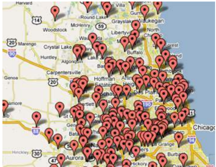
Chicago Area View