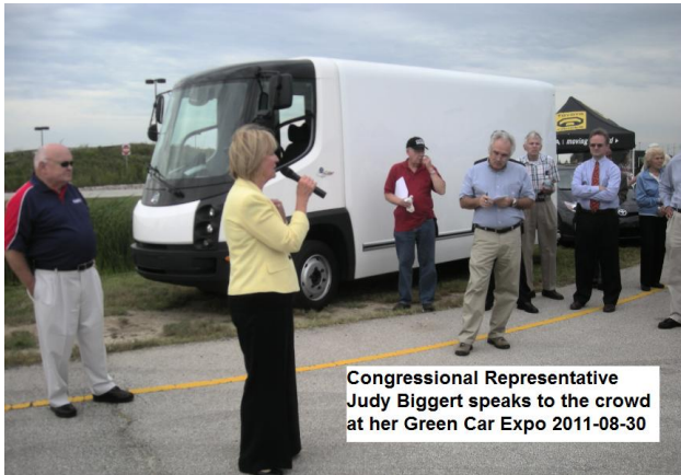
Congressional Representative Judy Biggert speaks to the crowd at her Green Car Expo 2011-08-30