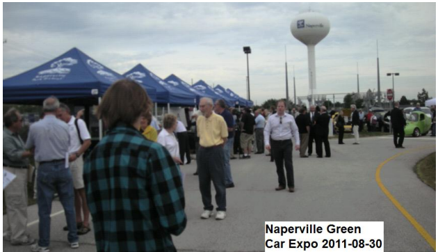
Naperville Green Car Expo 2011-08-30