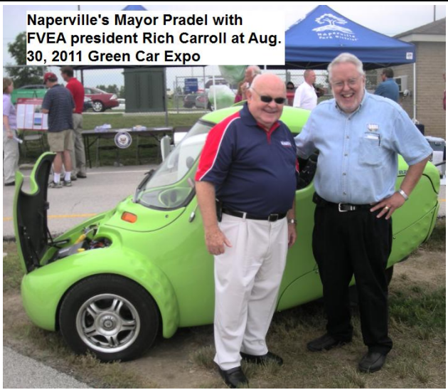
Naperville's Mayor Pradel with FVEA president Rich Carroll at Aug. 30, 2011 Green Car Expo