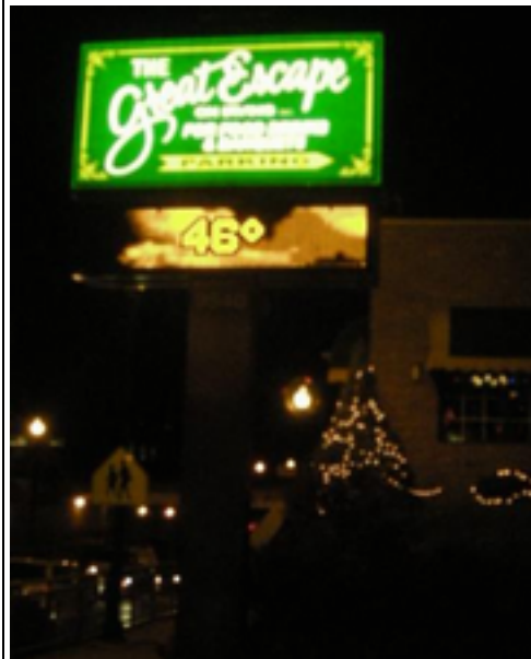
The Great Escape Restaurant