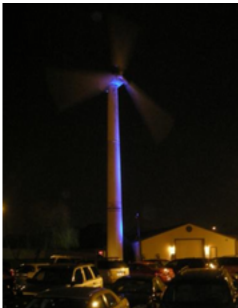
Wind Turbine power!