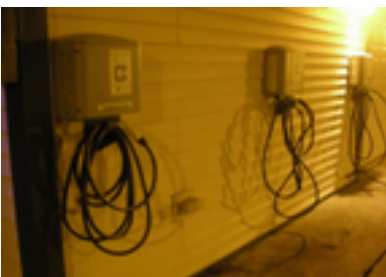
Clipper Creek Level 2 Charging Stations