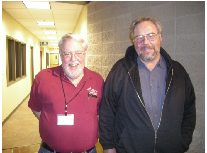
Rich & Rich