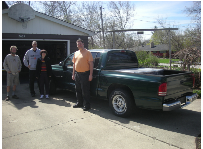
The Dodge Dakota