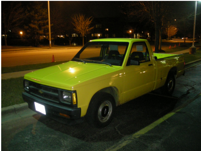
Ted's old Chevy S-10