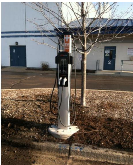
FVEAA contributed to this Chargepoint EVSE at the Fox Valley Ice Arena at 1996 S Kirk Rd #110, Geneva, IL.