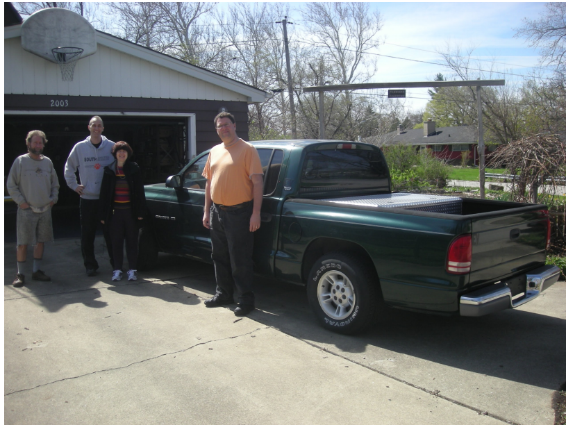
Session #0 Dakota Quad Cab Pickup 5/2/2014