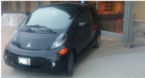
Mitsubishis getting a charge