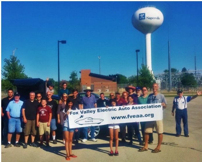
Naperville NDEW Event 9/18/2016