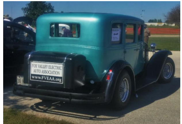
After the parade the 1930 Hupmobile PHEV with FVEEA magnetic sign on the trunk