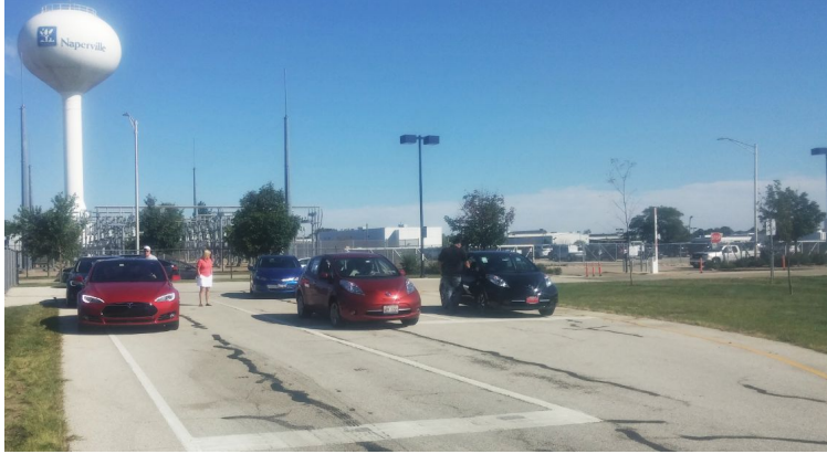
EVs lined up waiting for a trip around the track