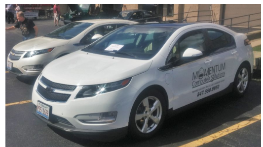
A couple of Volts from Dave Swingle