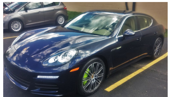
2016 Porsche Panamera E-Hybrid From Barrington MotorWerks