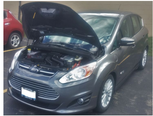
Ford CMAX Hybrid