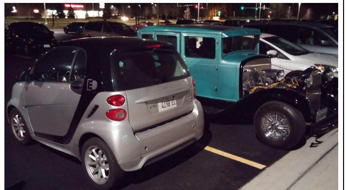
Fred's Smart EV and Bruce's Hupmobile