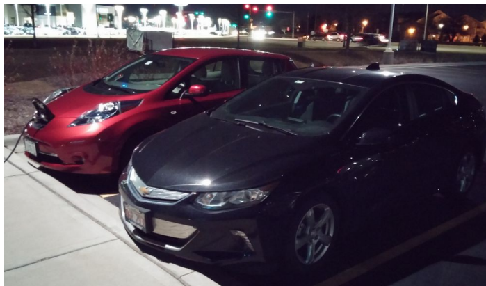
A Leaf and Volt getting juice.