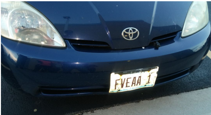
Steve's historically significant license plate