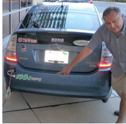
That still gets over 100 miles per gallon