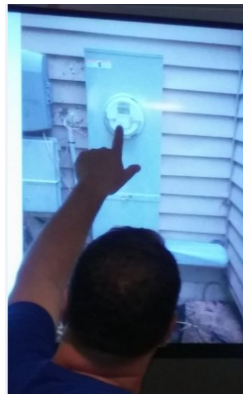
320amp meter that ComEd installed