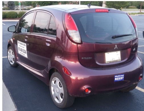
Jeff Green's iMiev looking sweet