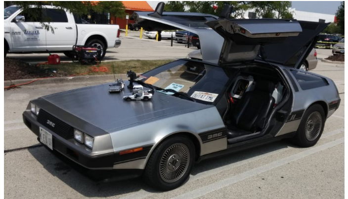
Delorean w FLux capacitor! Well, it was a running Delorean anyway