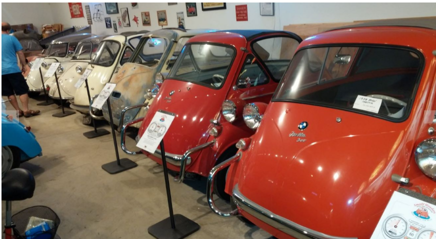
Row of early Isettas