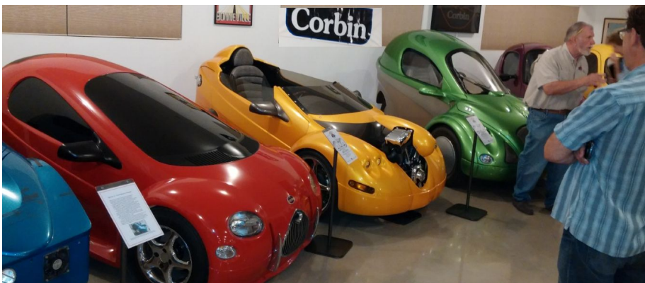
Beautiful Corbin Sparrow / Myers Motors NMGs (No More Gas) electrics on display