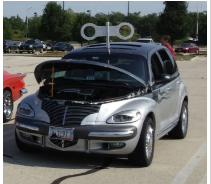
Even more efficient than an EV? Just wind it up and let er go !?!?