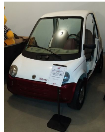
2000 Bombardier Electric