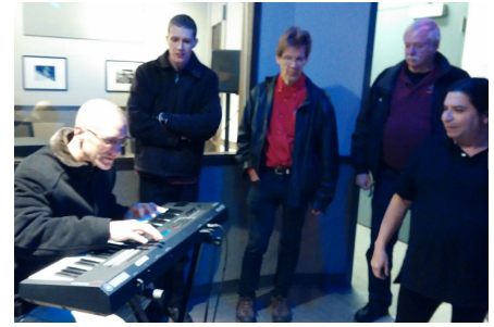
Having fun in the recording studio