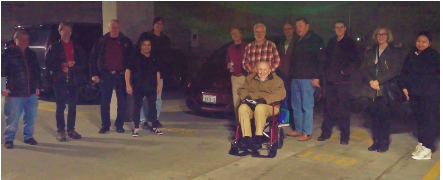
The group taking a tour of charging stations at One Arlington Apartments