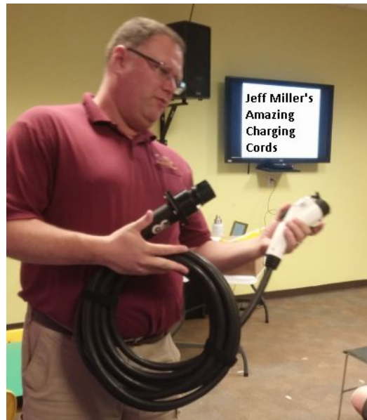
Tesla wall charger to J1772 adapter with J1772 to Tesla adapter in the Tesla end making it a 30 foot 80 amp J1772 extension cord in that configuration.