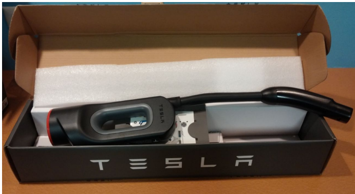
CHAdEMO to Tesla connector

extension, J1772 from Nema 14-50 for Bolt. Lower right: another 40A Tesla wall connector