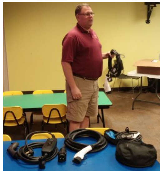
From left: Tesla wall connector 40A to Tesla (travel charger), 80A Tesla in to J1772 out 30 foot