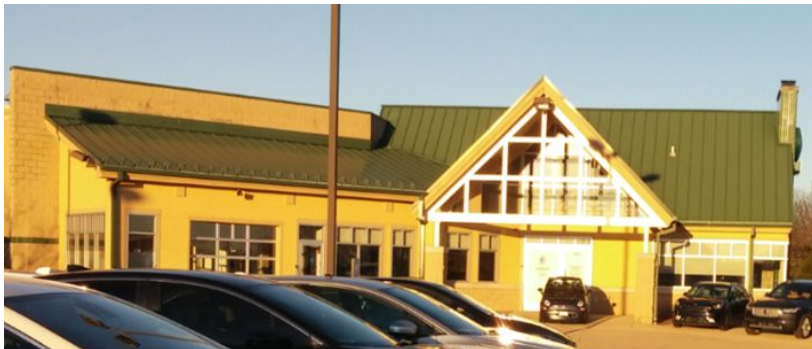
Current Automotive 1551 W Jefferson Ave. Naperville, IL 60540