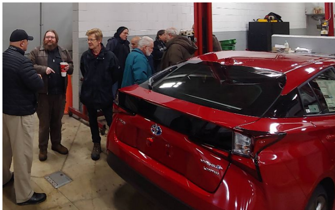
January 17, 2020 at Elmhurst Toyota