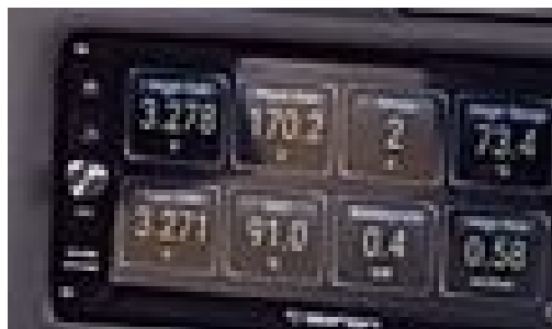
See the impressive BMS "Torque app" Chris integrated into his dash https://play.google.com/store/apps/details?id=org.prowl.torque&hl=en_US&gl=US