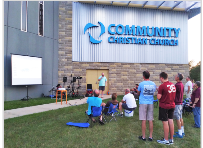
August 20th was A beautiful night for the hybrid outdoor / zoom FVEAA meeting