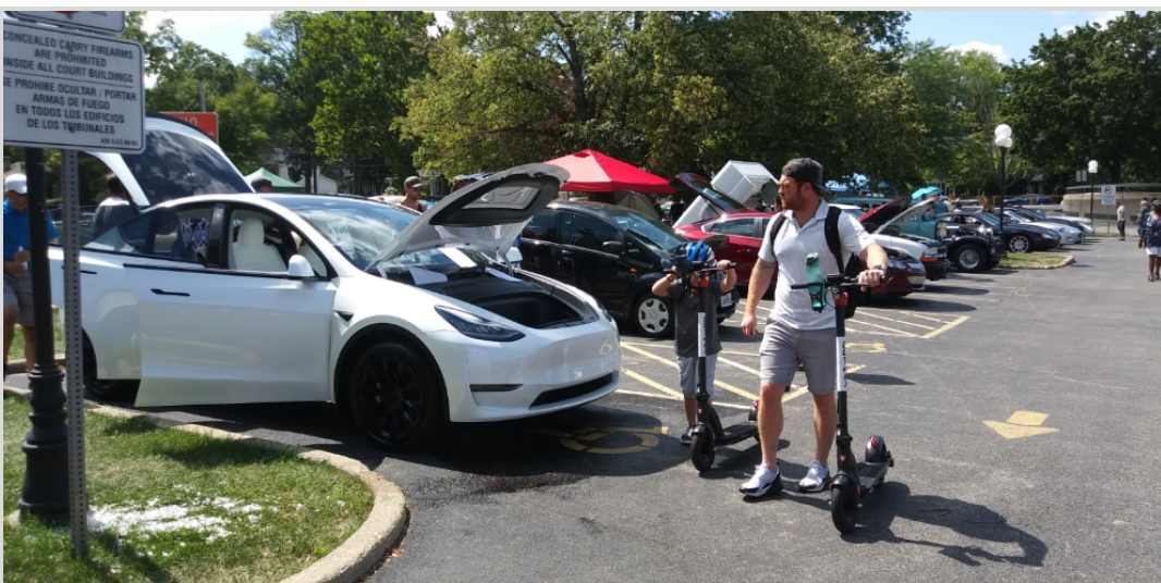
Tons of people attended the show including father and son with electric scooters passing by