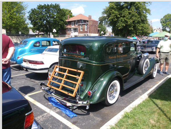
And there were all kinds of cars, hot rods, rare cars, luxury cars at the Concours d'elegance