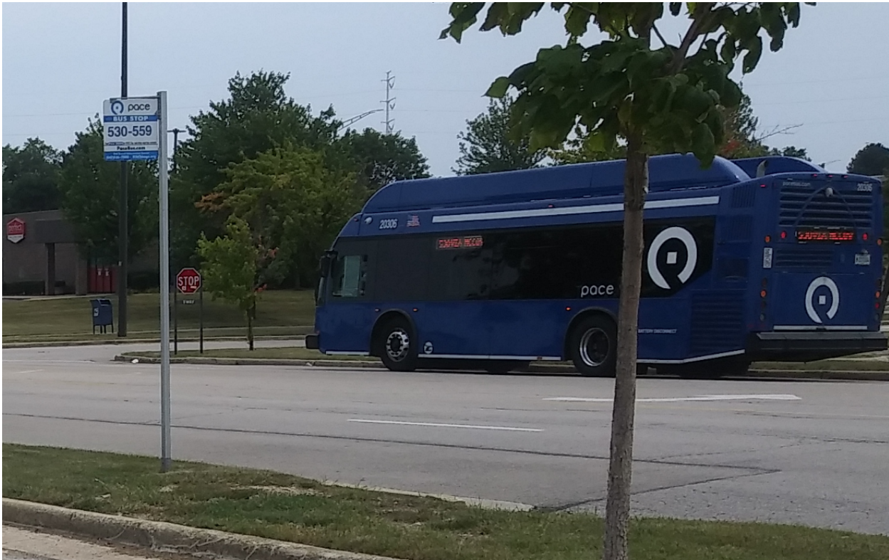
Standing right where the NDEW event is going to be held at Fox Valley Mall... at the PACE bus stop