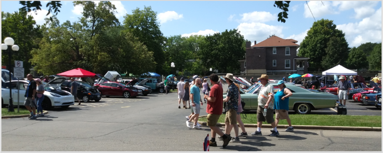
LOTS of attendees at the Geneva event. (FVEAA was over on the left) There were many hundreds of cars on display of all kinds