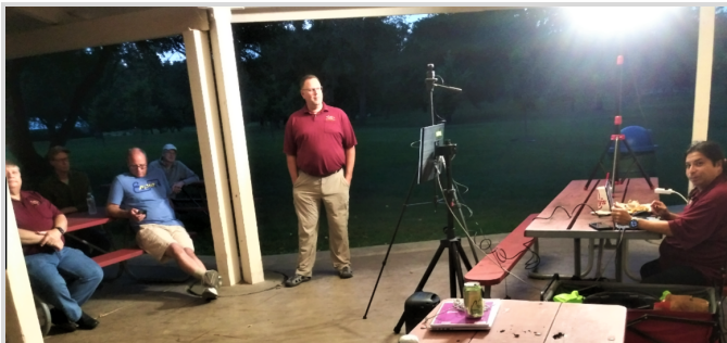
Nice Park District Pavilion in Geneva