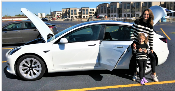
Kristen and little Gigi Bond wearing black and white outfits that match the Model 3's black and white color scheme