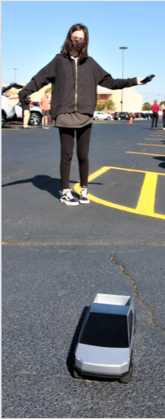
Remote controlled Tesla Cybertruck!