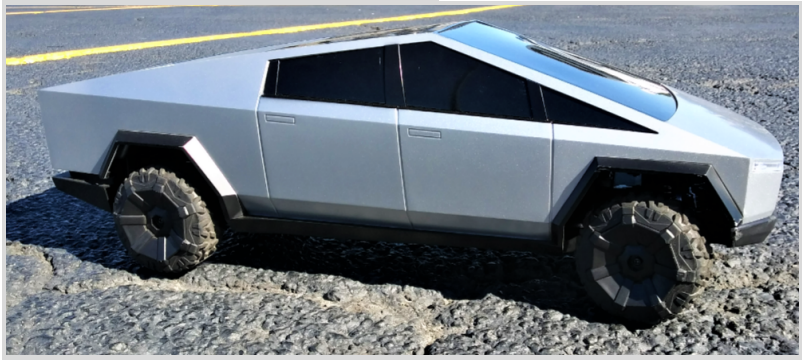
We had a Cybertruck! (well <=Teegan's remote controlled Cybertruck anyway)