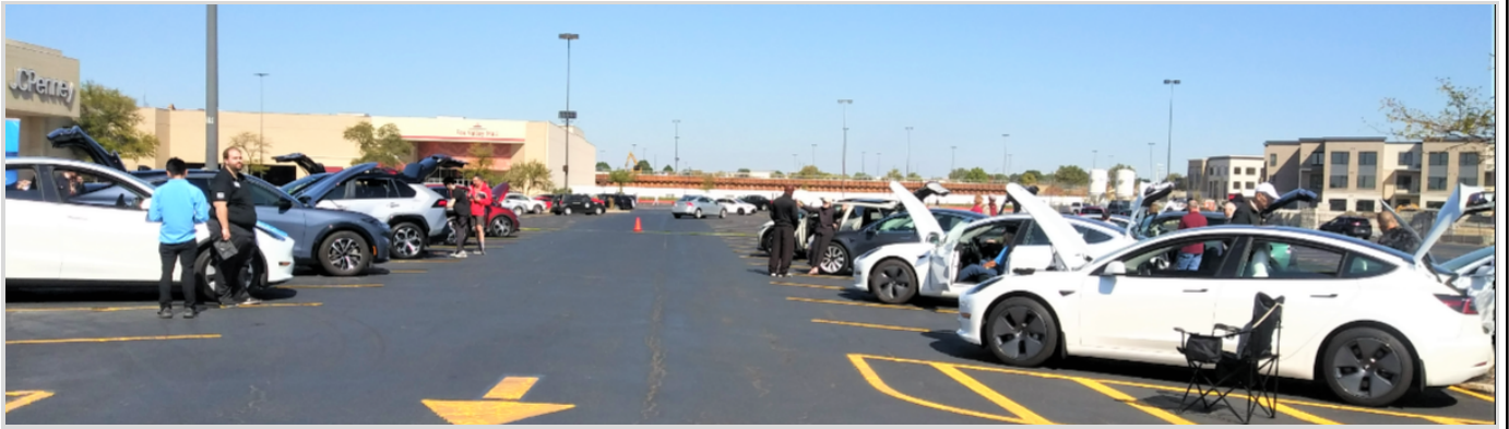
Oct 1, 2022 was a beautiful day for NDEW South!