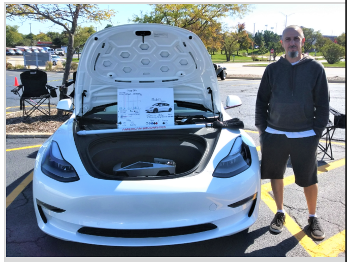
Nicely furnished Tesla Model 3!