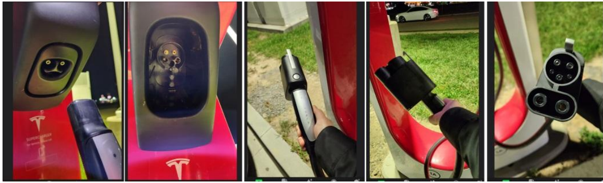
Various views of the Magic Dock port and conversion connectors