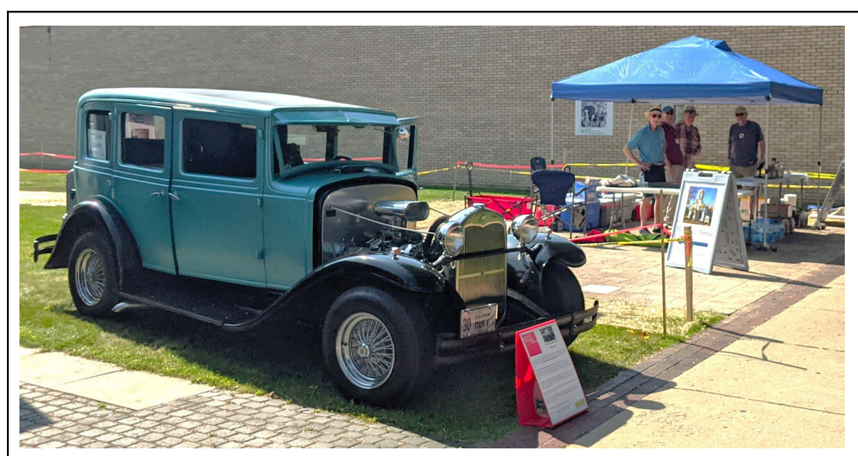
8/25/2024 At the Concours d'Elegance in Geneva, Tracey McFadden under the canopy with men from the Unitarian Universalist Society selling cold water and drinks on a VERY hot day. The team sold LOTS and lots of cold drinks! There was also a lot of interest in the Hupmobile