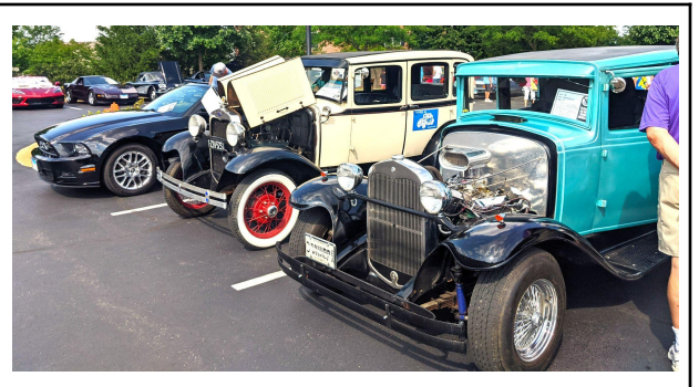
Variety of cars at the show