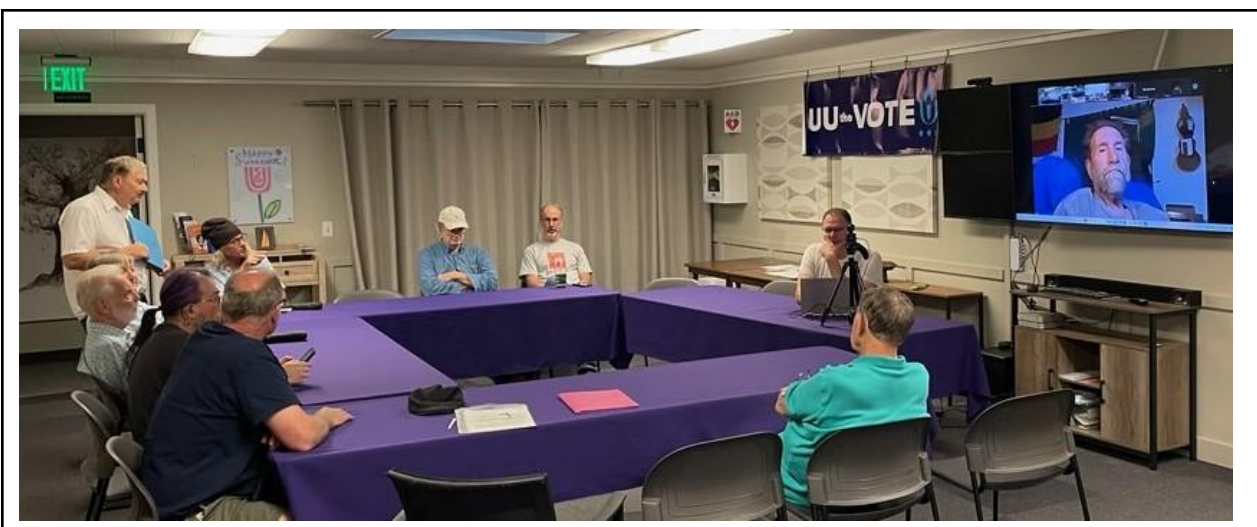
Aug. 16, 2024 FVEAA Meeting at the Unitarian Universalist Society of Geneva