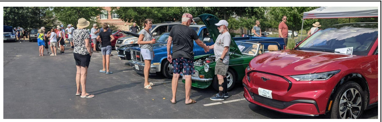
Red Ford Mustang Electric among the cars displayed at the Carillon car show