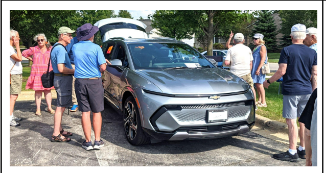
Chevy Equinox at the Carillon car show

Thanks to Tim Moore for coordinating our participation in this car show at Carillon!