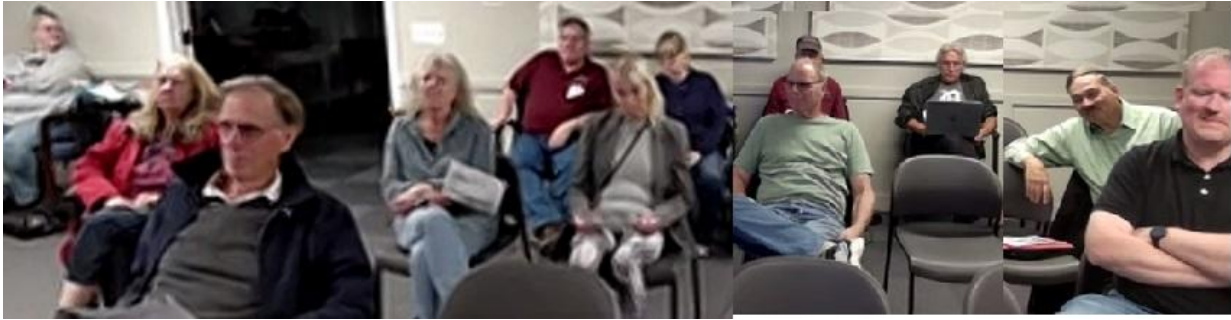
Meeting attendees at the FVEAA meeting, Unitarian Universalist Society of Geneva