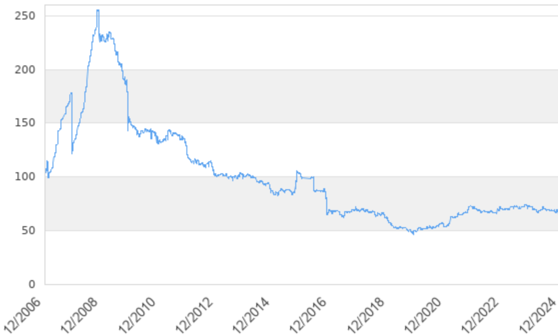
FVEAA Paid Up Members as of February 19, 2025 12:41pm

— Members: Minimum: 46 on 2019-11-12, Maximum: 255 on 2008-10-28, Latest: 66 on 2025-02-19