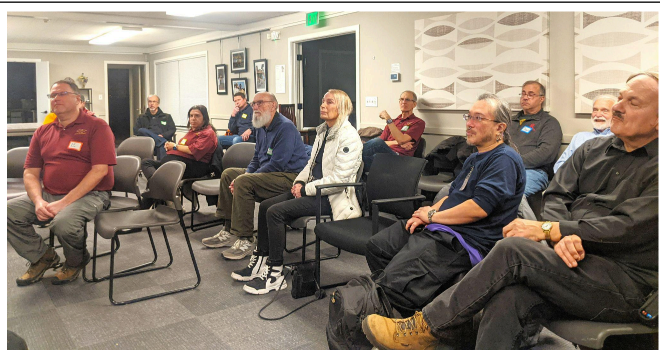
Meeting attendees on February 21st